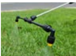
OPTIONAL BOOM (WP2-T $29)