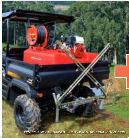
PICTURED: 300L MOTORISED SQUATPAK WITH OPTIONAL RP1-33 BOOM