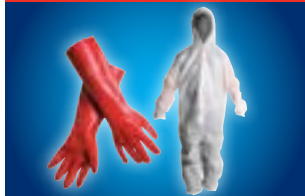
CHEMICAL GLOVES (SCP4000) & COVERALLS (SCP8010)