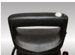
CONVENIENT ON/OFF SWITCH