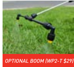
OPTIONAL BOOM (WP2-T $29)