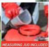
MEASURING JUG INCLUDED