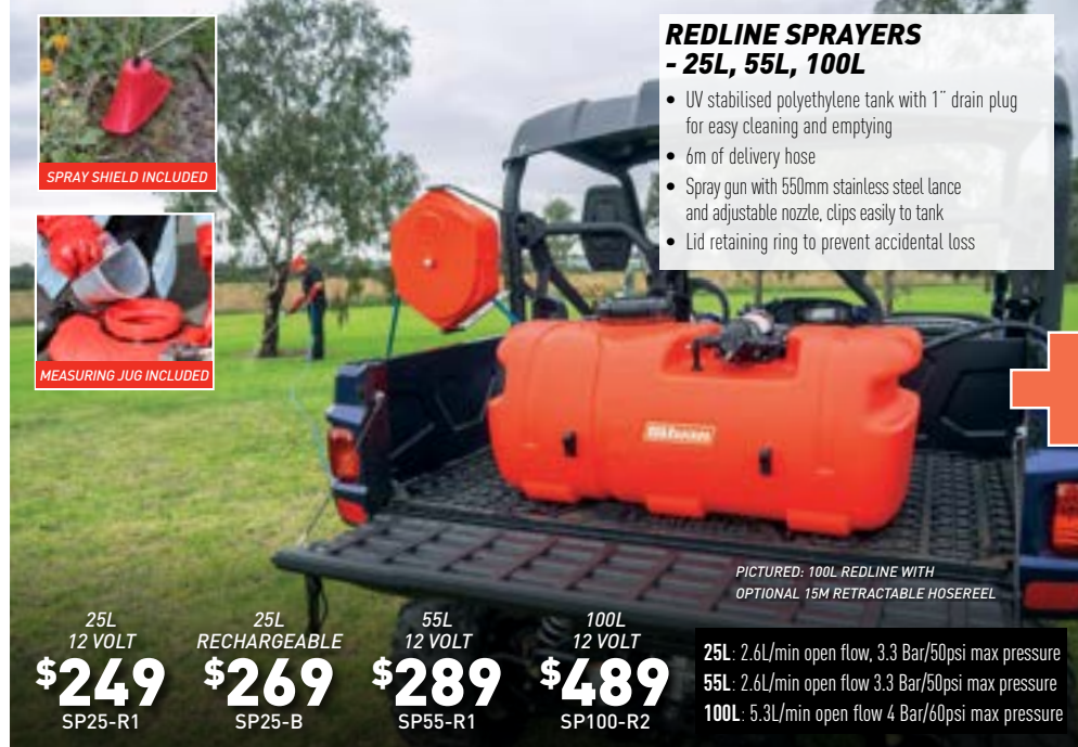
PICTURED: 100L REDLINE WITH OPTIONAL 15M RETRACTABLE HOSE REEL