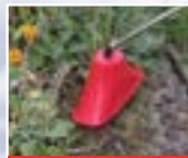
SPRAY SHIELD INCLUDED

The Redline range of 12V sprayers are the most feature packed economical sprayers in Australia. Ideal for weed control, spot and fence line spraying, they fit neatly onto the back of most quad bikes, UTV's and utility style vehicles.