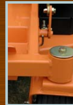
Heavy-duty tubular steel frame proves a solid foundation for years of reliable service.