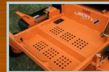
Spacious footplate has pierced, extruded steel pattern, allowing dirt and debris to fall through to maintain safe foot grip.