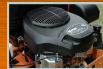
Powerful Kohler 7000 series Pro V-Twin engine options provide smooth, reliable power. Protected by a heavy-duty rear engine guard.