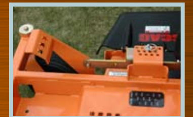
Easy-to-use height-of-cut adjustment is quick, and conveniently adjusts from 1½” to 4½” in ¼” increments.