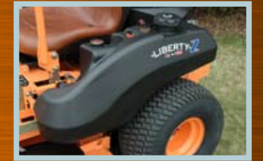
5.5 gallon total fuel capacity maximizes refueling intervals to save time and get the job done fast. Cup holder built into fuel tank for operator convenience.