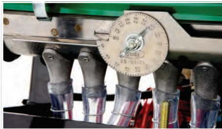
The seed depth guide allows for seeding at variable rates and for different grass varieties and applications.

Specifications subject to change without notice.