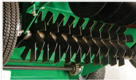
Durable cutting blades can be adjusted down to a depth of 1/2".