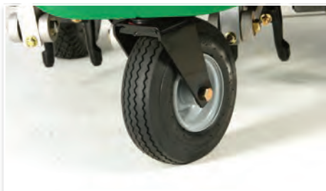
A unique front caster wheel allows the machine to maneuver with near zero-turn capability.

Specifications subject to change without notice.