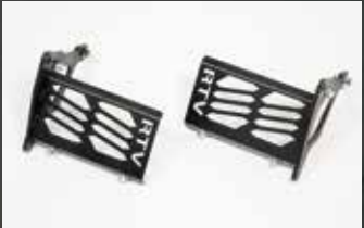
Tail lamp guard