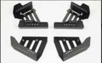
A-arm guard (Front / Rear)