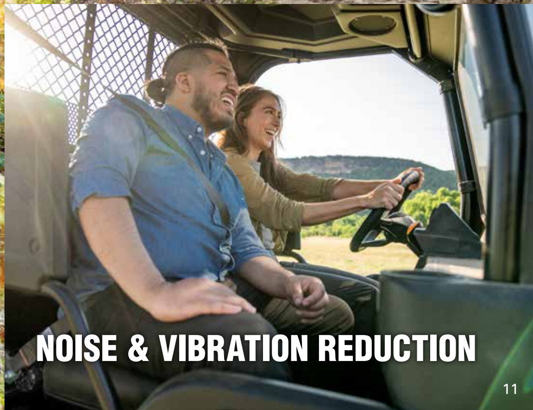
NOISE & VIBRATION REDUCTION