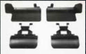
Mud guard (Front / Rear)