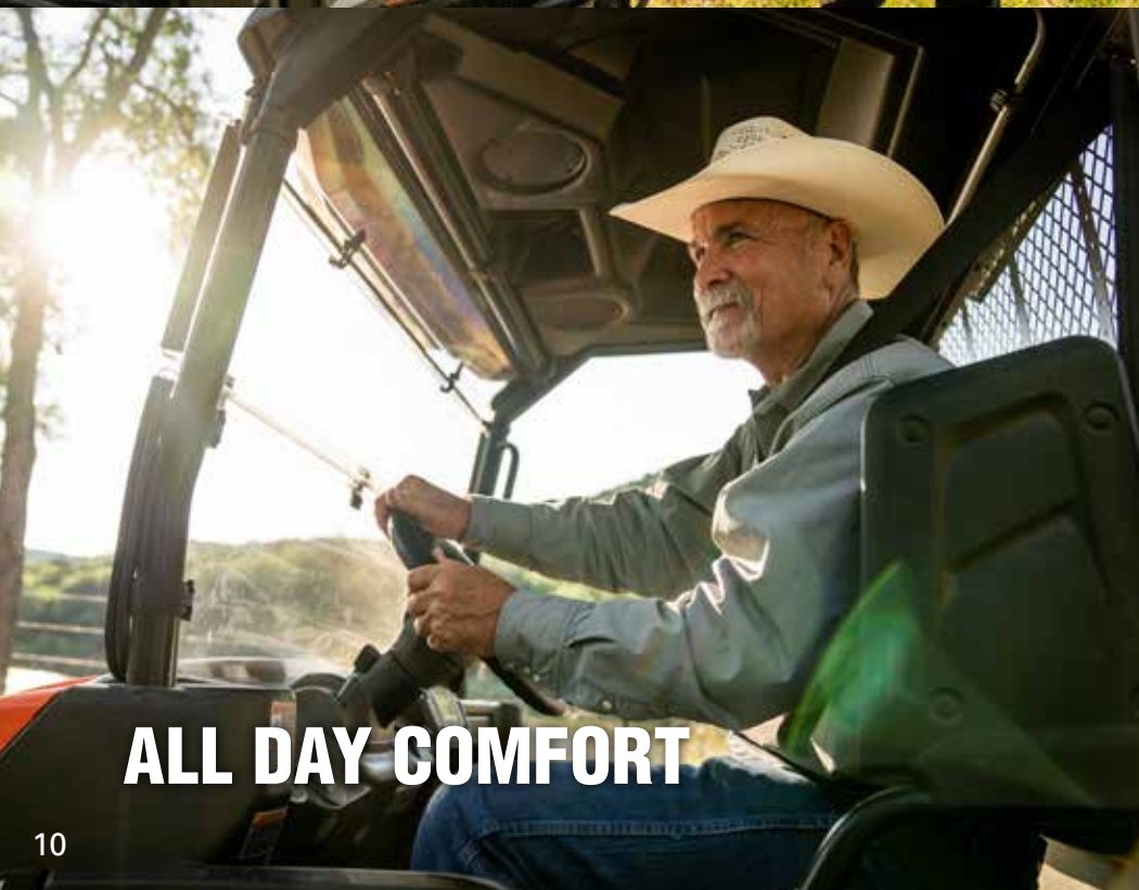
ALL DAY COMFORT