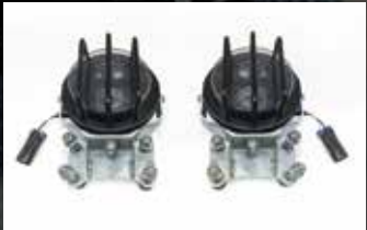
Front work light