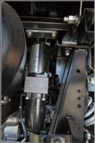
Electric hydraulic bed lift kit (left: dump switch / right: lift cylinder)