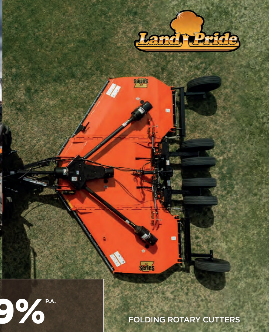
FOLDING ROTARY CUTTERS