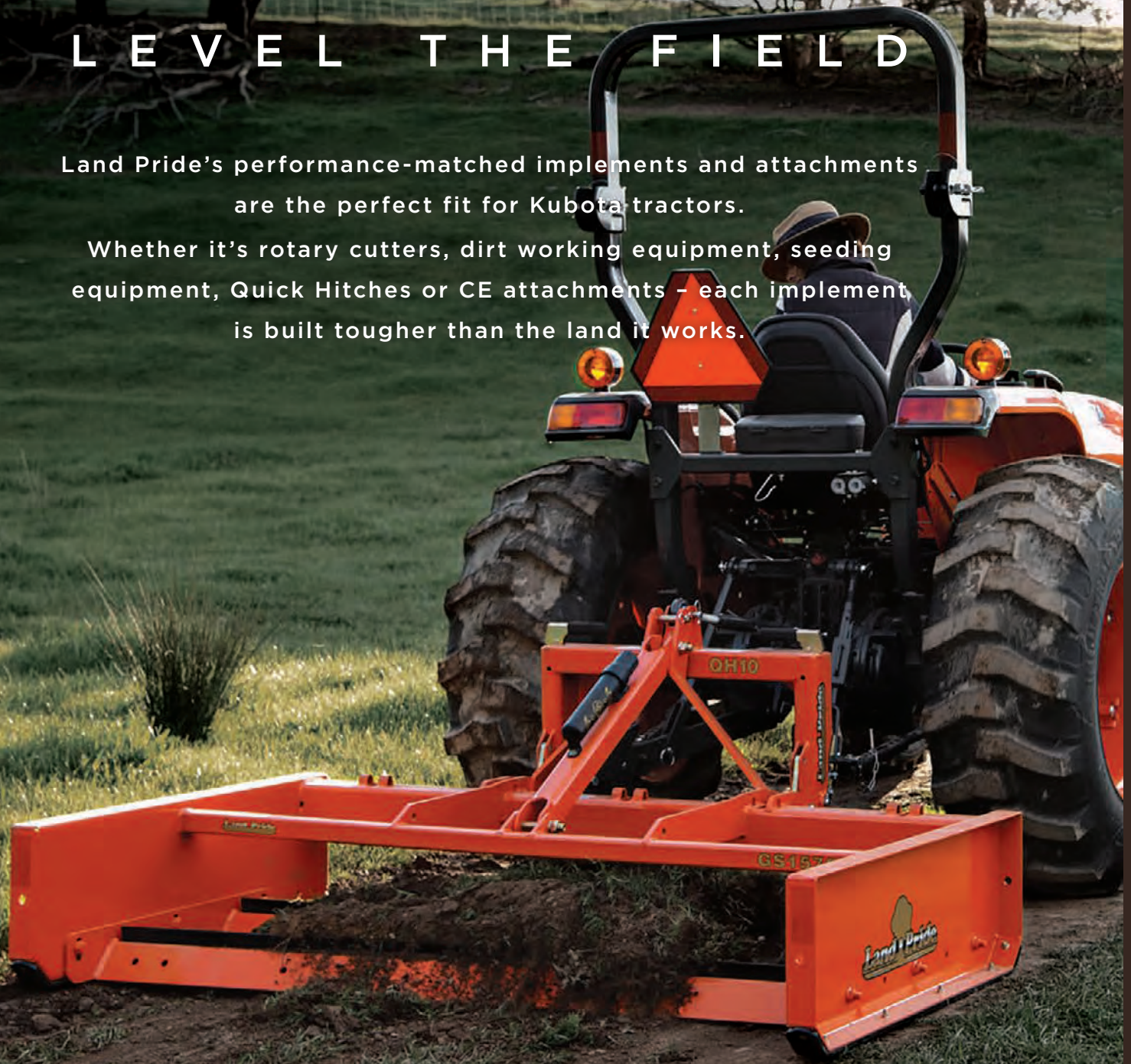
BOX & GRADER SCRAPERS

Whether it's rotary cutters, dirt working equipment, seeding equipment, Quick Hitches or CE attachments - each implement is built tougher than the land it works.