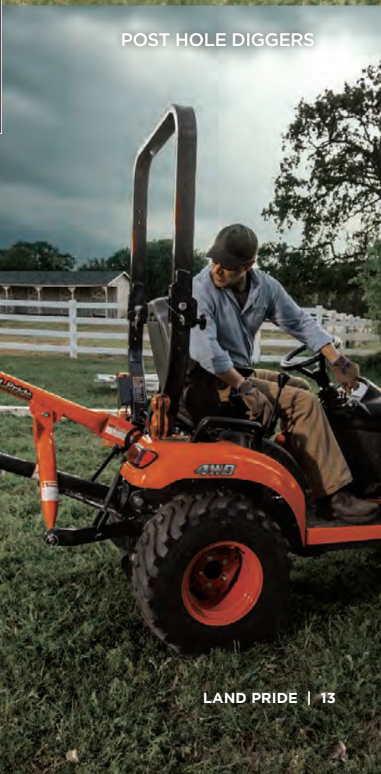
POST HOLE DIGGERS

0.9% P.A. FINANCE FOR 24 MONTHS* across the Land Pride ag range