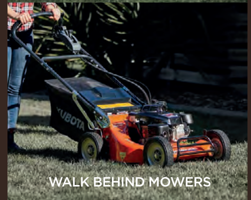
WALK BEHIND MOWERS