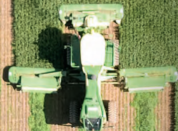
BIGM450CR SELF PROPELLED MOWER

To thrive in Australia's tough, unpredictable environment, you need even tougher equipment to meet it head on. Krone's leading hay and silage equipment puts exacting German engineering at your command, giving you the performance to take on each task as efficiently as possible.