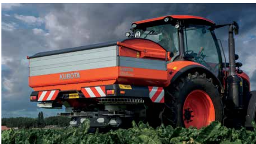
DS DISC SPREADERS