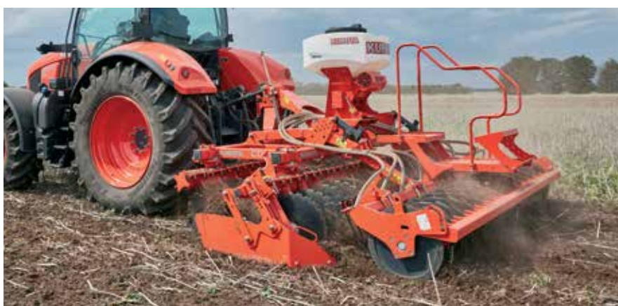
CD COMPACT DISCS

Electrically controlled hopper cover makes opening and closing easy from the drivers seat