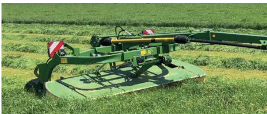
EC TRAILED MOWERS - ECTC320CRS

ECTS360CR/S and ECTS360CV available with a wide working width of 3.6m