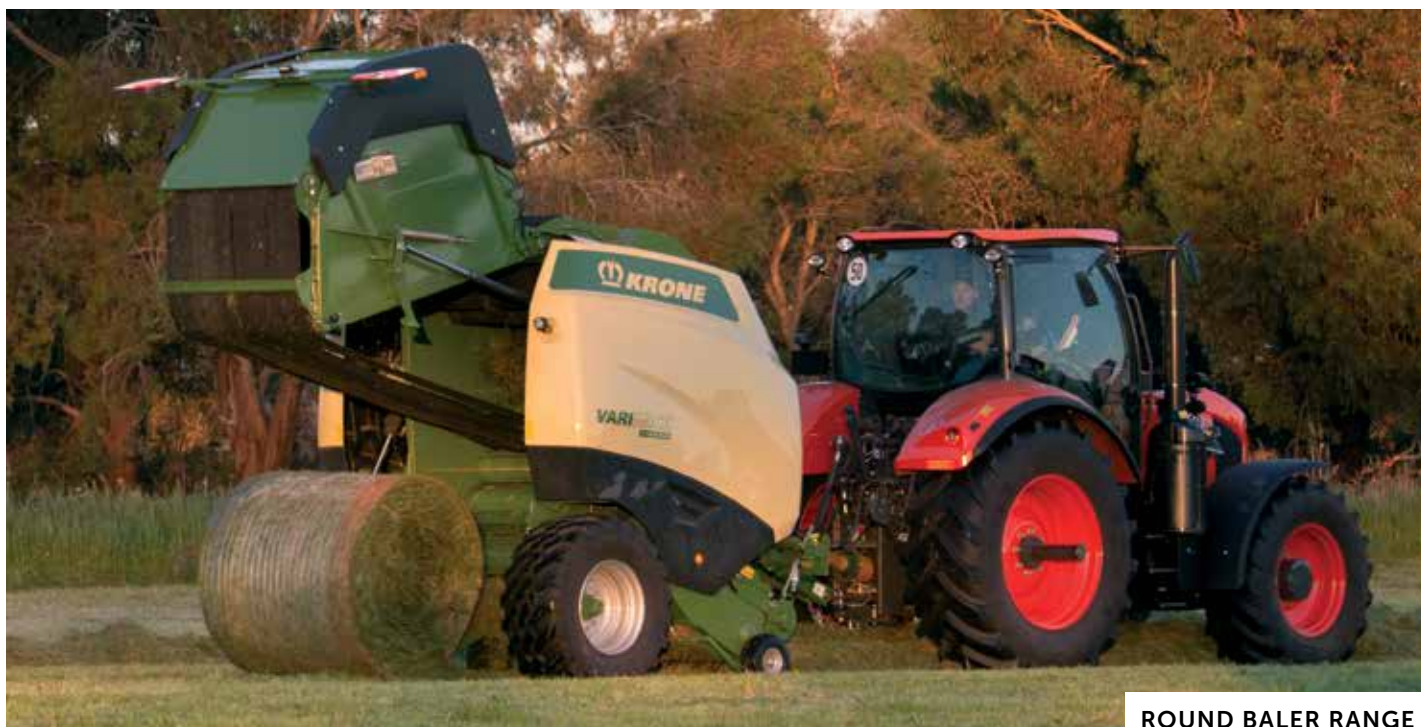
ROUND BALER RANGE