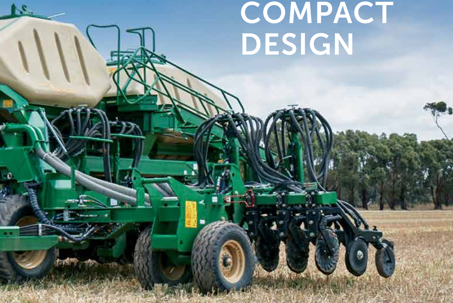
NTA907-2 - 9M SPARTAN NO-TILL AIR DRILL