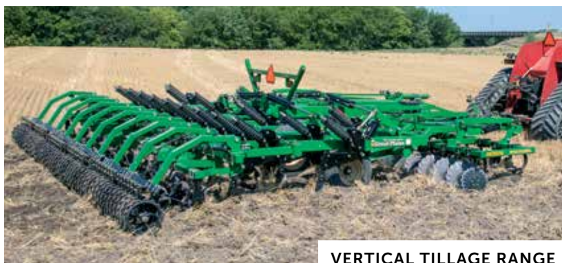
VERTICAL TILLAGE RANGE

Heavy duty toggle trip shanks with 2,450lbs (1,111kg) trip force