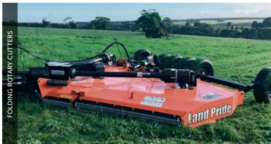
FOLDING ROTARY CUTTERS

Match your professional Kubota M Series with Land Pride's performance matched folding rotary cutters. Working widths from 12ft (3.6m) to 20ft (6.1m). A range of models to suit every application from basic farm grass maintenance to roadside mowing contractors.