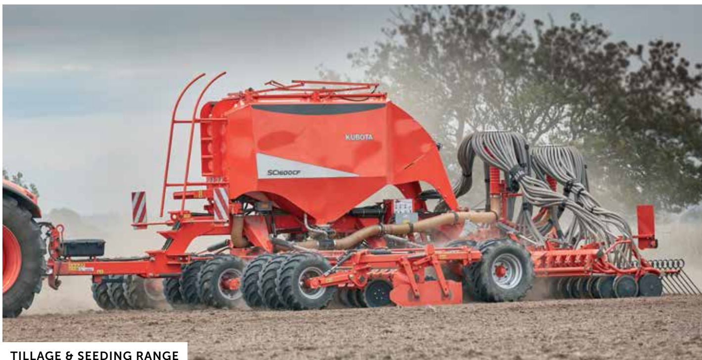
TILLAGE &amp; SEEDING RANGE