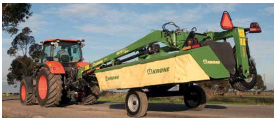
EASYCUT TRAILED CENTRE ECTC400 WITH OPTIONAL TRANSPORT KIT

Steel conditioner design comes from North America (not an M-roll), however suits very well in Australian high crop conditions