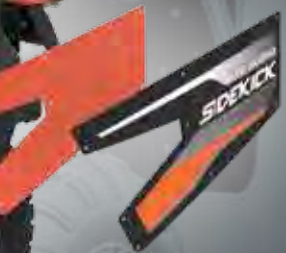
Door insert kits