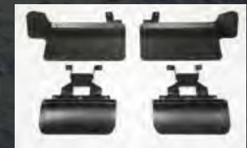
Mud guard (Front / Rear)