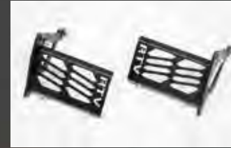
Tail lamp guard