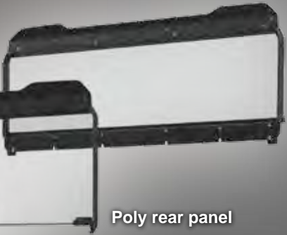
Poly rear panel