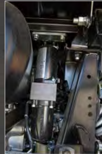
Electric hydraulic bed lift kit (left: dump switch / right: lift cylinder)