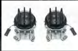
Front work light