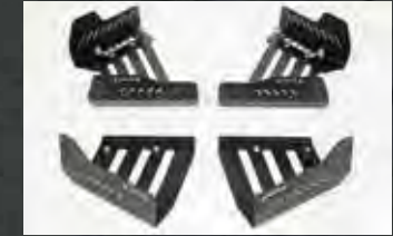
A-arm guard (Front / Rear)