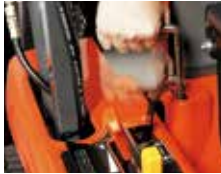
To clean the rear of the duct

Our Quick Clean System raises productivity by making it easy to clear even wet grass without leaving the driver's seat. Simply use the lever to simply clear a path to the grass collector.