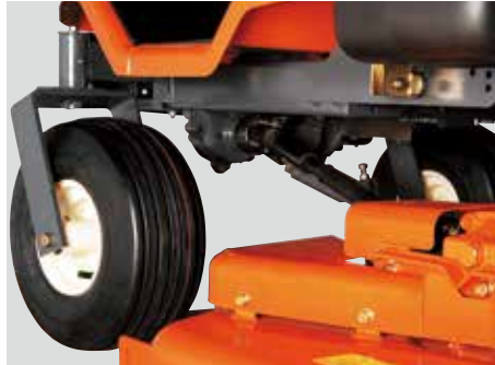
Actual shaft is covered.

Our incomparable wet-type, multi-disc clutch is so durable, it'll outlast most others. While our wet-type, single-disc brake provides incredible stopping power for safer operation.