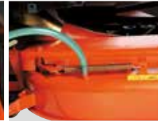
Deck cleaning pipe for connecting water hose