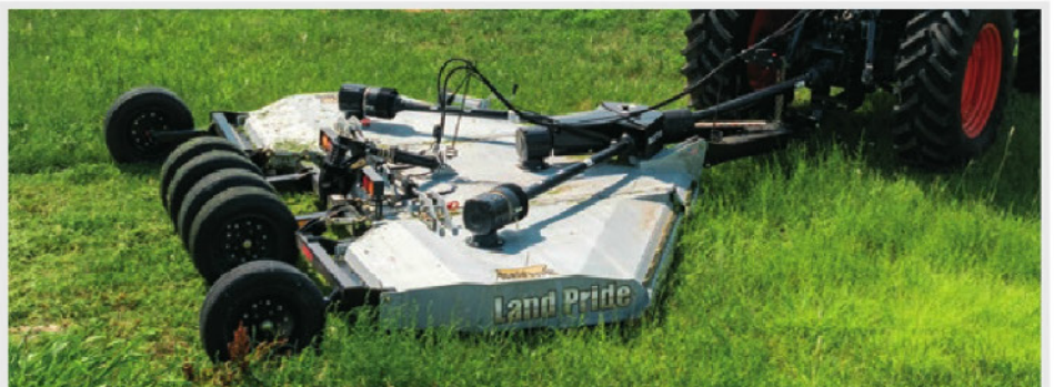
PERFORMANCE MATCHED ROTARY CUTTERS