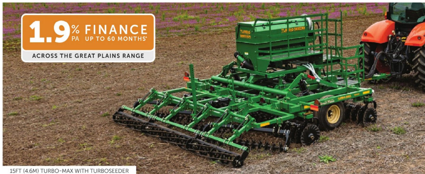
15FT (4.6M) TURBO-MAX WITH TURBOSEEDER

Designed with soil conservation in mind. Does not excessively work soil therefore avoiding soil erosion problems