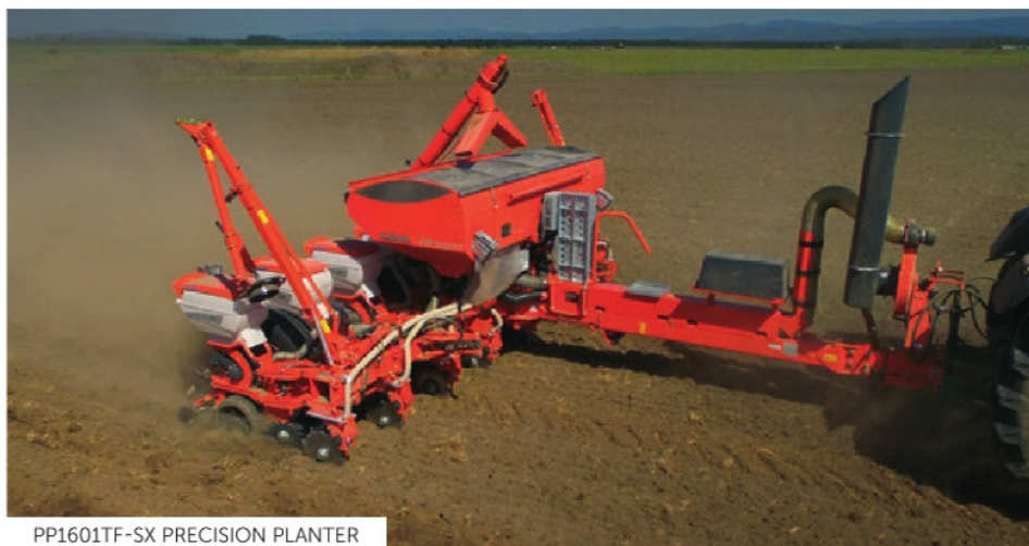
PP1601TF-SX PRECISION PLANTER

Up to 18km/h working speeds with the NEW SX High Speed Planter