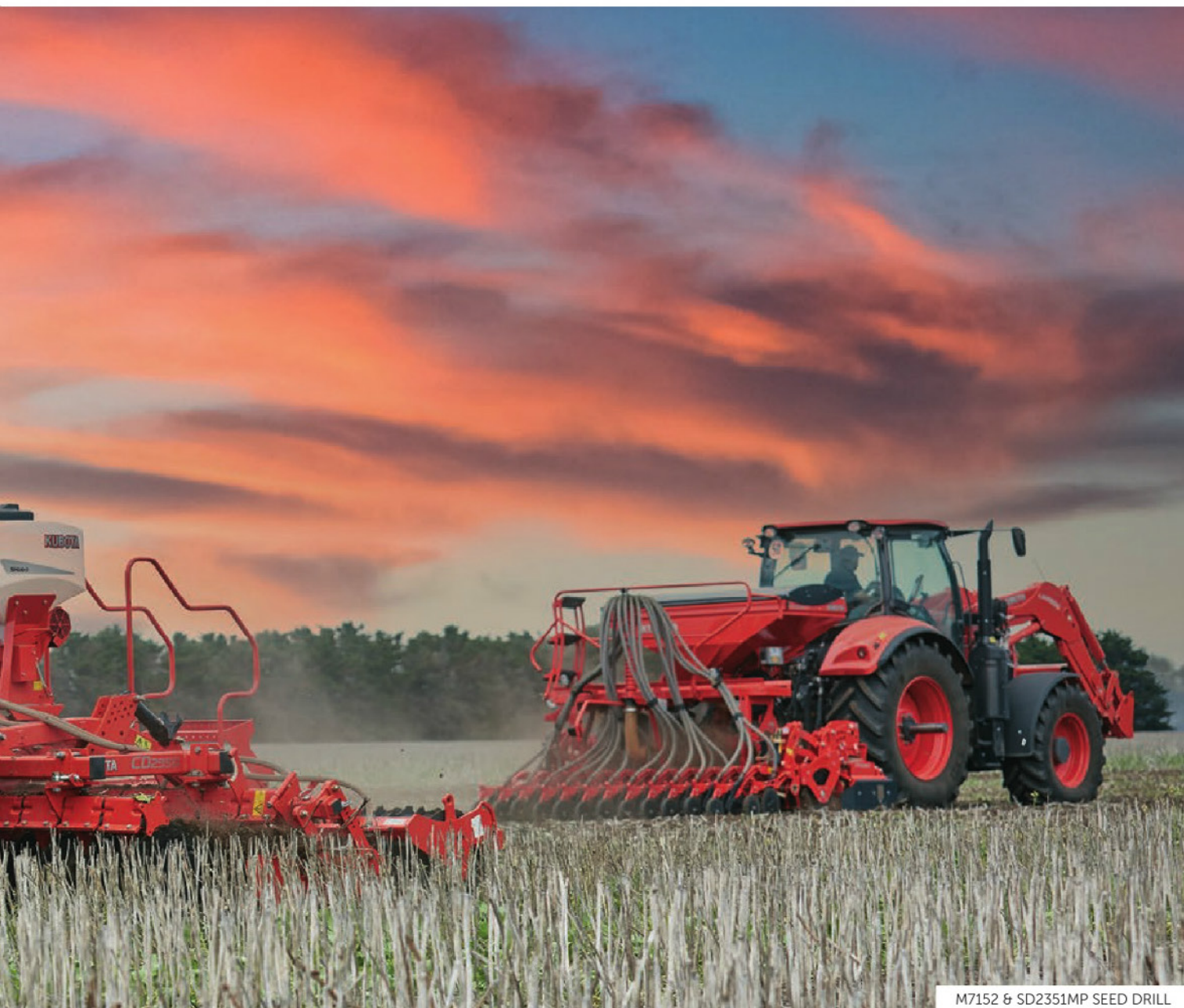
M7152 & SD2351MP SEED DRILL