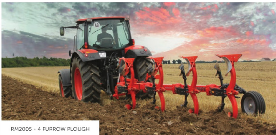
RM2005 - 4 FURROW PLOUGH

The Kubota Power Harrows are designed for heavy conditions and are built for tractors up to 400hp. Special emphasis has been given to reliability and a strong trough design. This has been achieved by having a large distance between the conical bearings, hardened gears in the trough, and a heavy-duty rigid trough design.