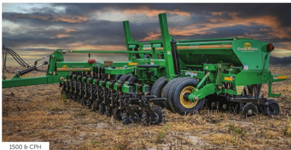
1500 & CPH

Full length seed tube guides seed to the bottom of the seed trench ensuring accurate placement