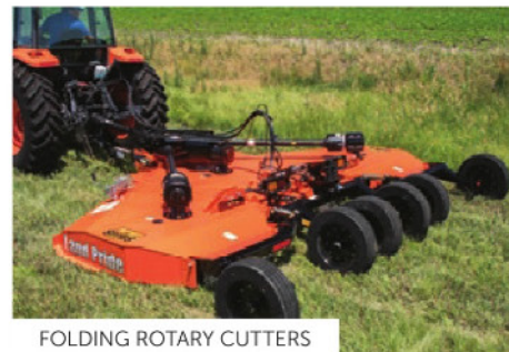
FOLDING ROTARY CUTTERS