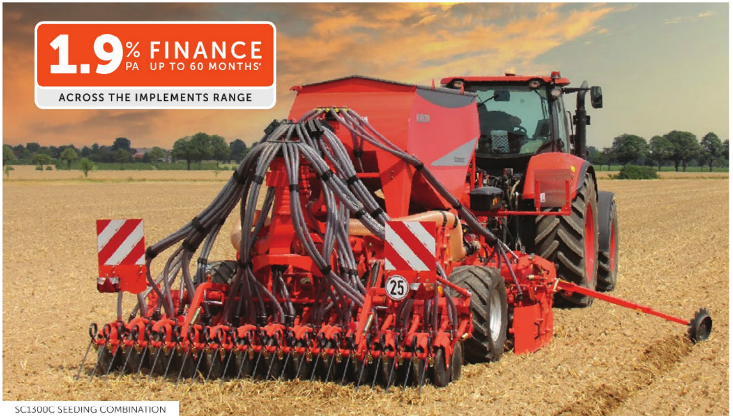
SC1300C SEEDING COMBINATION