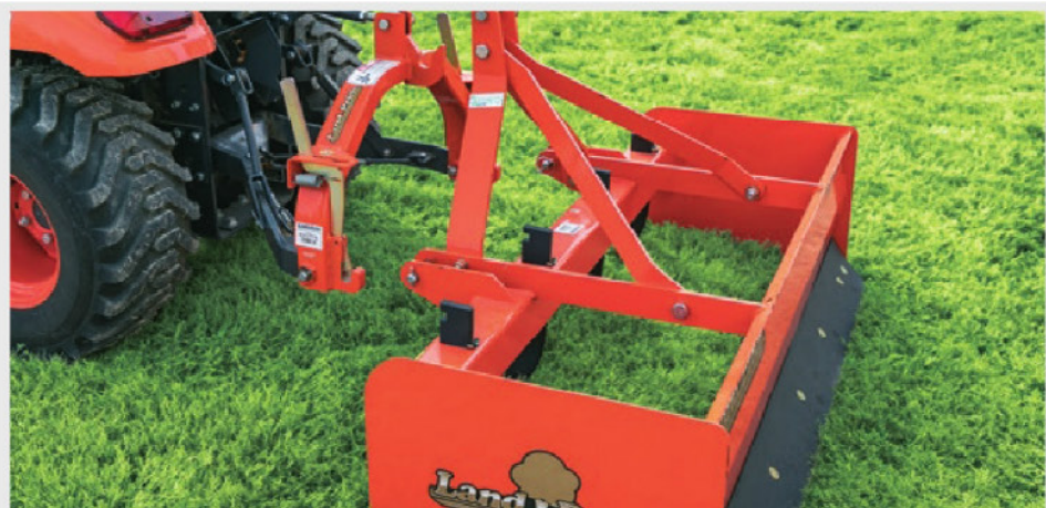
QUICK HITCH AND BOX BLADE