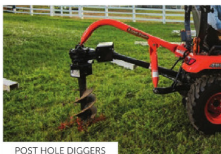
POST HOLE DIGGERS