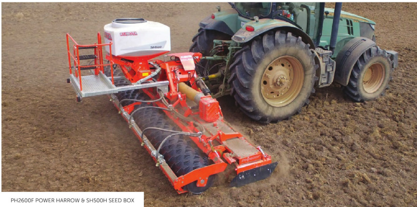
PH2600F POWER HARROW & SH500H SEED BOX