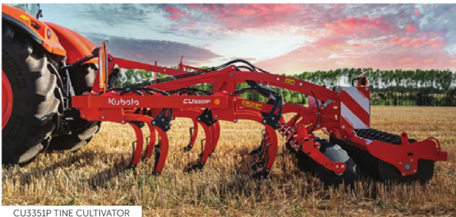
CU3351P TINE CULTIVATOR

Easily adapted for heavy and sticky soil conditions