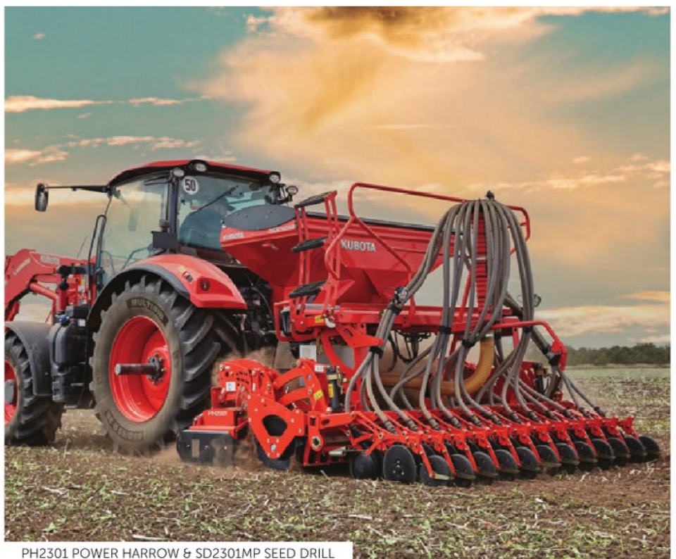
PH2301 POWER HARROW & SD2301MP SEED DRILL

Also lower spec price efficient seeding options available