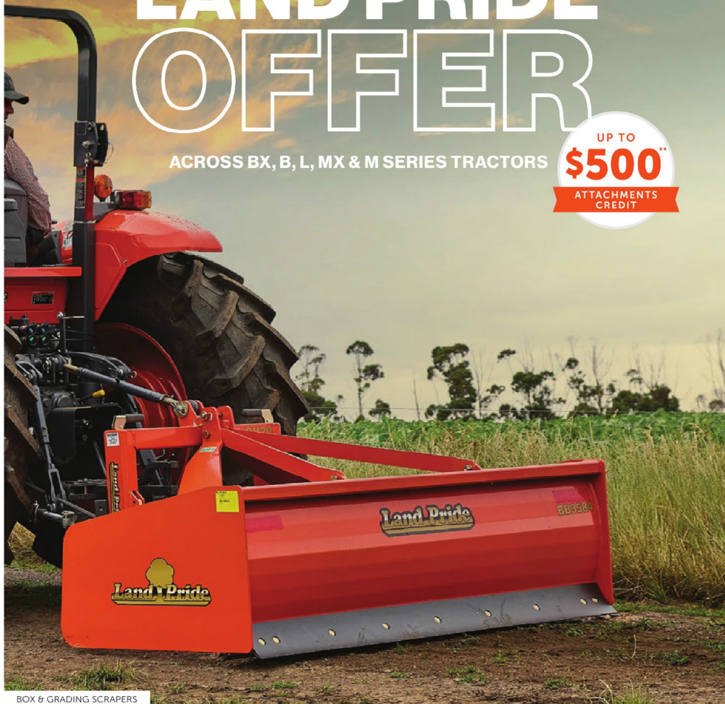
BOX & GRADING SCRAPERS