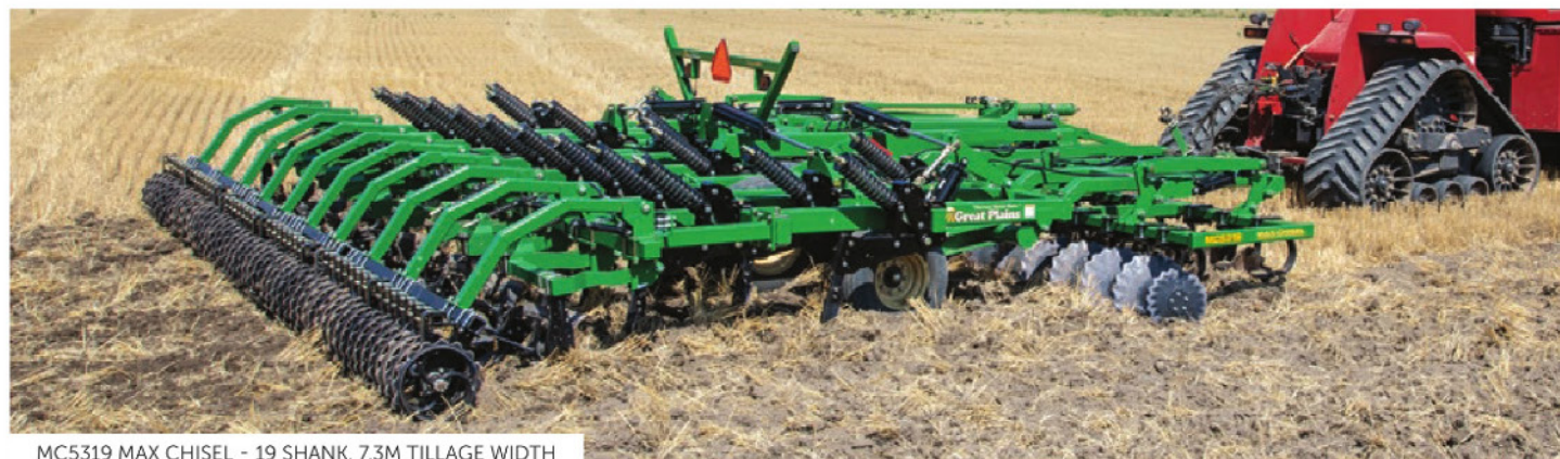
MC5319 MAX CHISEL - 19 SHANK, 7.3M TILLAGE WIDTH

Rear chopper reel finishing tool chops residue and smoothens finish