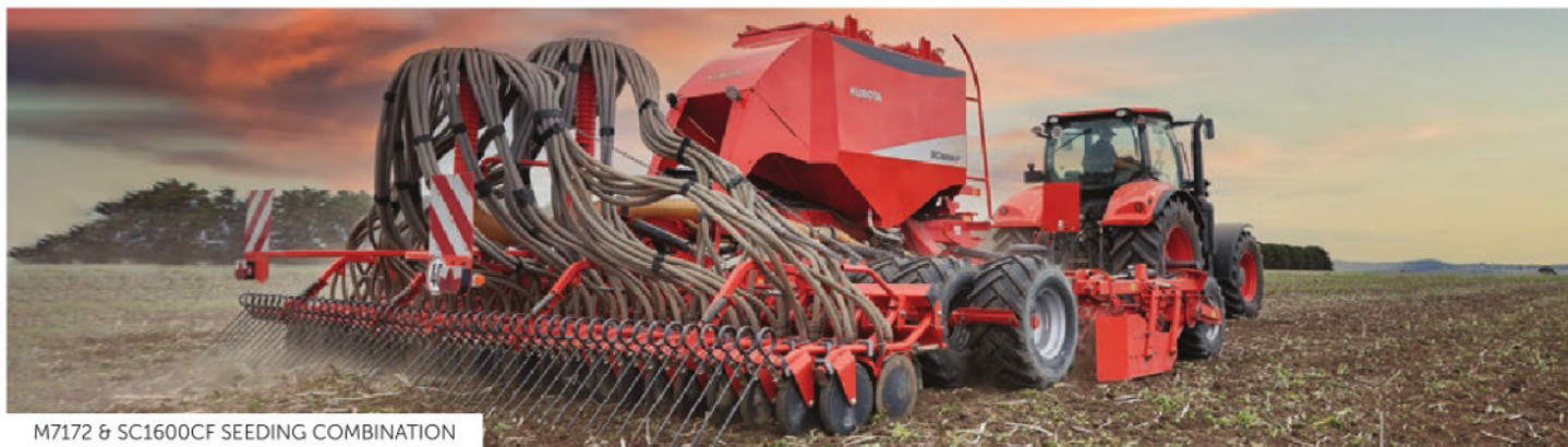
M7172 & SC1600CF SEEDING COMBINATION