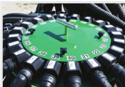
INTEGRATED BLOCKAGE SENSORS AS STANDARD

The Great Plains Spartan range has the versatility you need in a compact package.