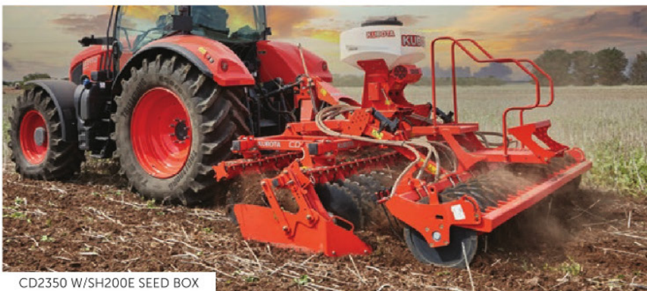
CD2350 W/SH200E SEED BOX