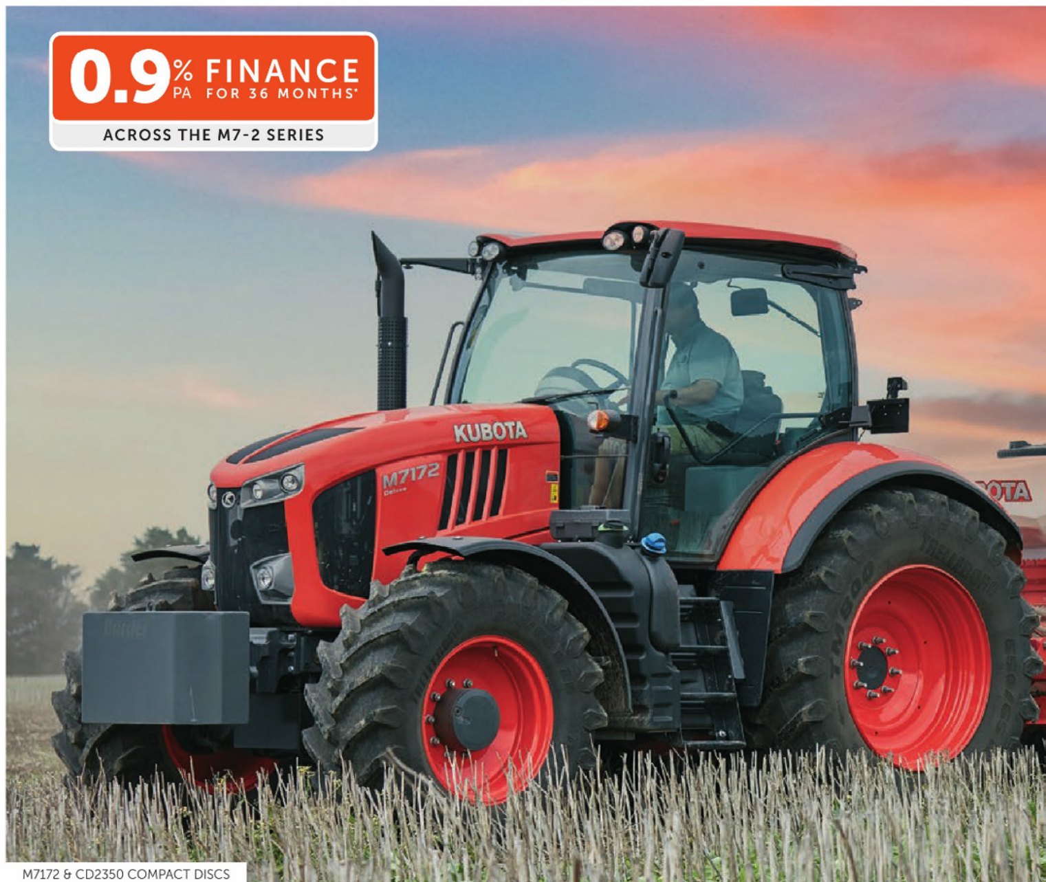
M7172 & CD2350 COMPACT DISCS