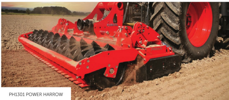
PH1301 POWER HARROW