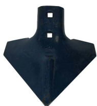
10" x 8mm Dart Point