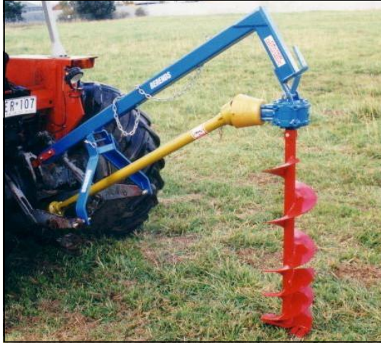
Standard Model with 12" Auger