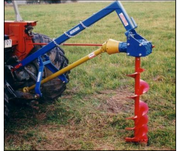
Heavy Duty Model with 12" Auger