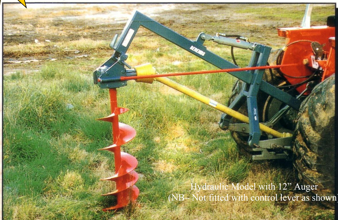
Hydraulic Model with 12" Auger (NB- Not fitted with control lever as shown)