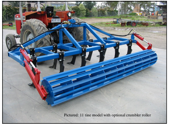
Pictured: 11 tine model with optional crumbler roller

“Eliminates soil compaction, reduces soil erosion, improves microbial activity around the root zone and increases water absorption and retention”