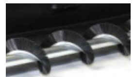
POWERED REAR ROLLING CLEANING BRUSH