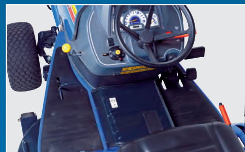
SPACIOUS OPERATOR'S AREA AND NEWLY DESIGNED EXTERIOR