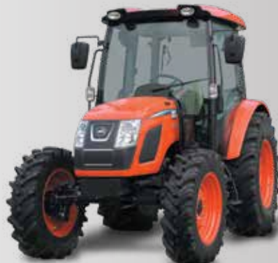
RX6030 60HP CAB $56,177 EX GST $61,795 INC GST