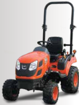
CS2610 25HP ROPS $23,177 EX GST $25,495 INC GST