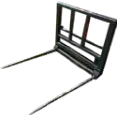
ONE SIZE $1,245