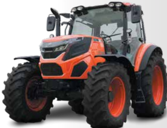
HX1301 130HP CAB $109,995 EX GST $120,995 INC GST