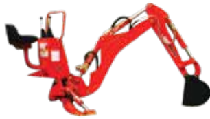
CS SERIES $7,795