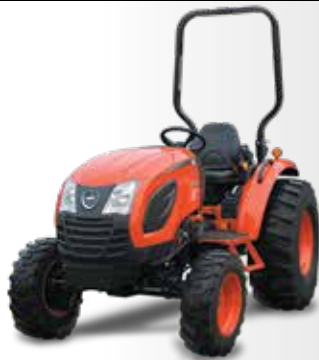
CK3010 30HP HST ROPS $29,777 EX GST $32,755 INC GST