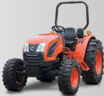
DK4810 48HP HST ROPS $40,905 EX GST $44,995 INC GST