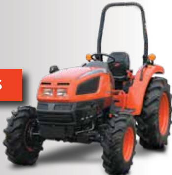
EX5310 53HP ROPS $37,995 EX GST $41,795 INC GST