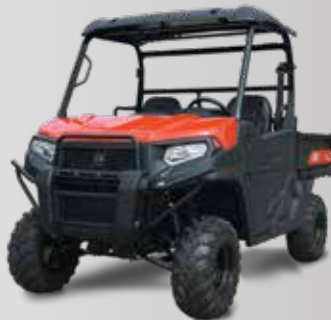
K9 2400 24HP UTV $23,450 EX GST $25,795 INC GST