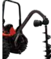
STD PHD $2,265