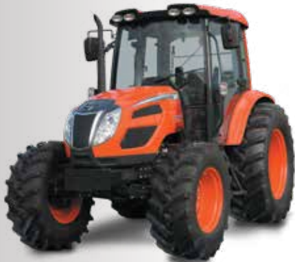
PX9520 95HP ROPS $64,995 EX GST $71,495 INC GST